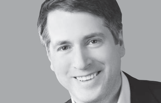
RICH LOWRY, King Features Syndicate

to go with the majority. Yet, Biden -- desperate to stop his bleeding among young voters who are more pro-Palestinian than the rest of the electorate -- can’t resist the pull of the fraction.