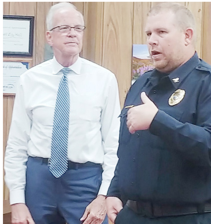
THE ANDERSON COUNTY REVIEW 5-21-2024