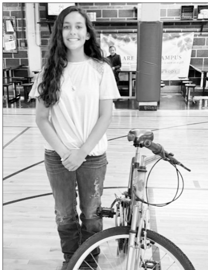
THE ANDERSON COUNTY REVIEW 05-21-2024