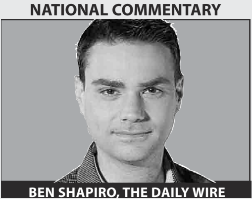
BEN SHAPIRO, THE DAILY WIRE

President Trump's latest foray into the world of international economics — his ongoing trade war with China — has been widely derided by his critics. It's been derided on the grounds that there is no long-term strategy; on the grounds that the trade war will not be, as Trump has bragged, "good and easy to win"; on the grounds that Trump continues to send mixed signals, simultaneously claiming that China is bearing the brunt of his tariffs while desperately urging Federal Reserve Chairman Jerome Powell to lower interest rates.