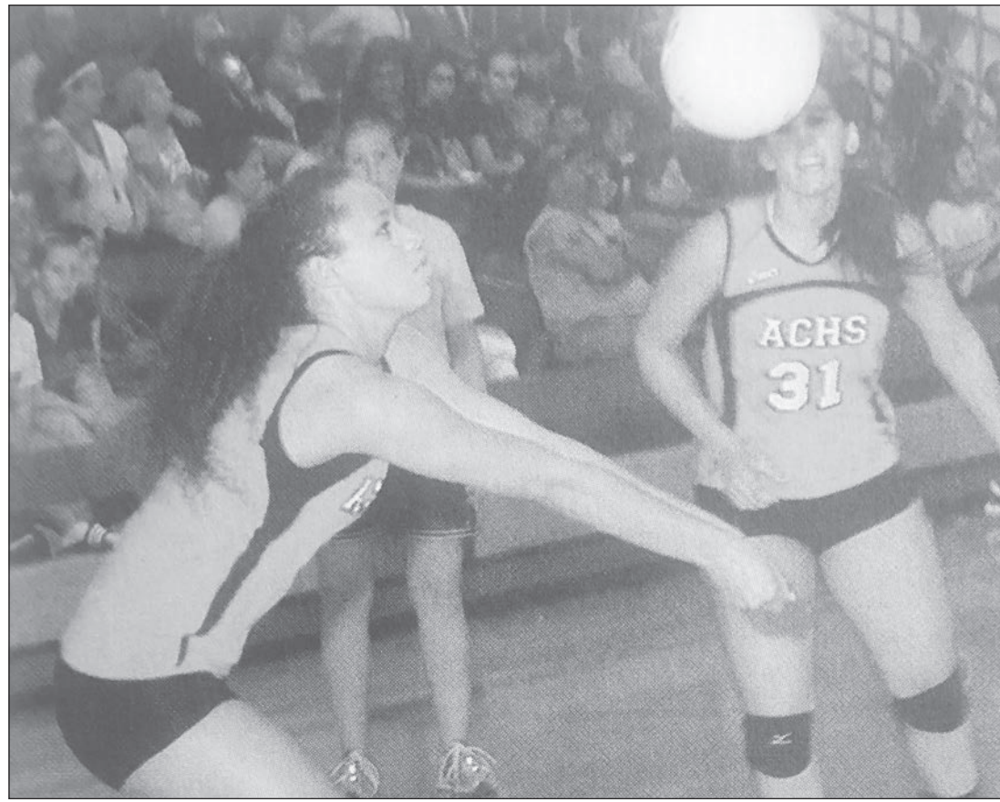
THE ANDERSON COUNTY REVIEW 9-3-2019 / ARCHIVE

Sell them the whole car and offer a discount! Run your ad here 3 times and get the 4th FREE!! Call to place your ad ... (785) 448-3121