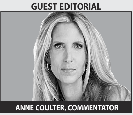
ANNE COULTER, COMMENTATOR

Even before The New York Times launched its "All Slavery, All the Time" project, no one could accuse that paper of skimping on its race coverage, particularly stories about black males killed by white(ish) police officers.