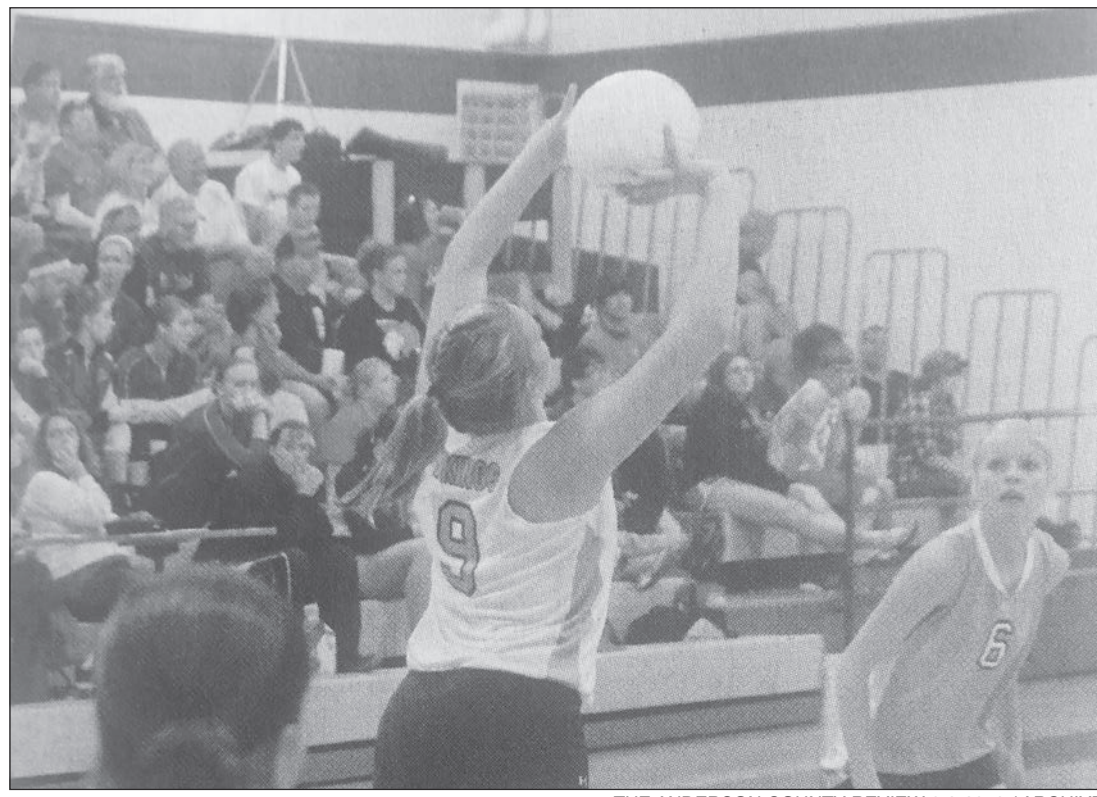
THE ANDERSON COUNTY REVIEW 9-3-2019 / ARCHIVE