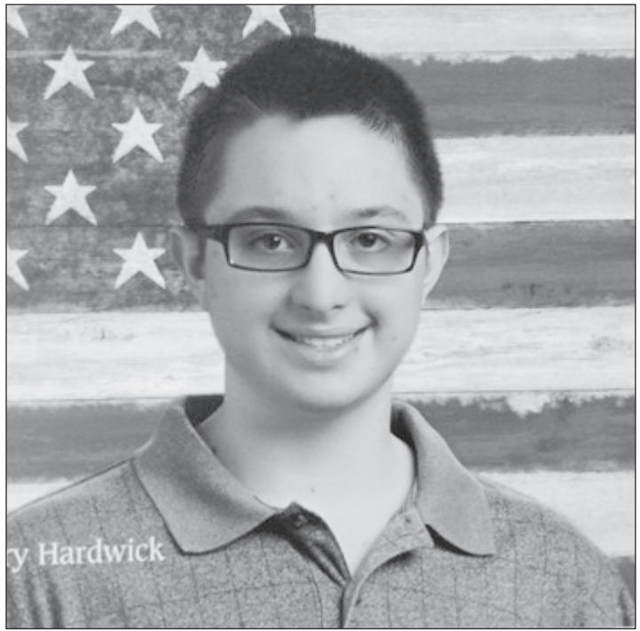
THE ANDERSON COUNTY REVIEW 1-10-2017