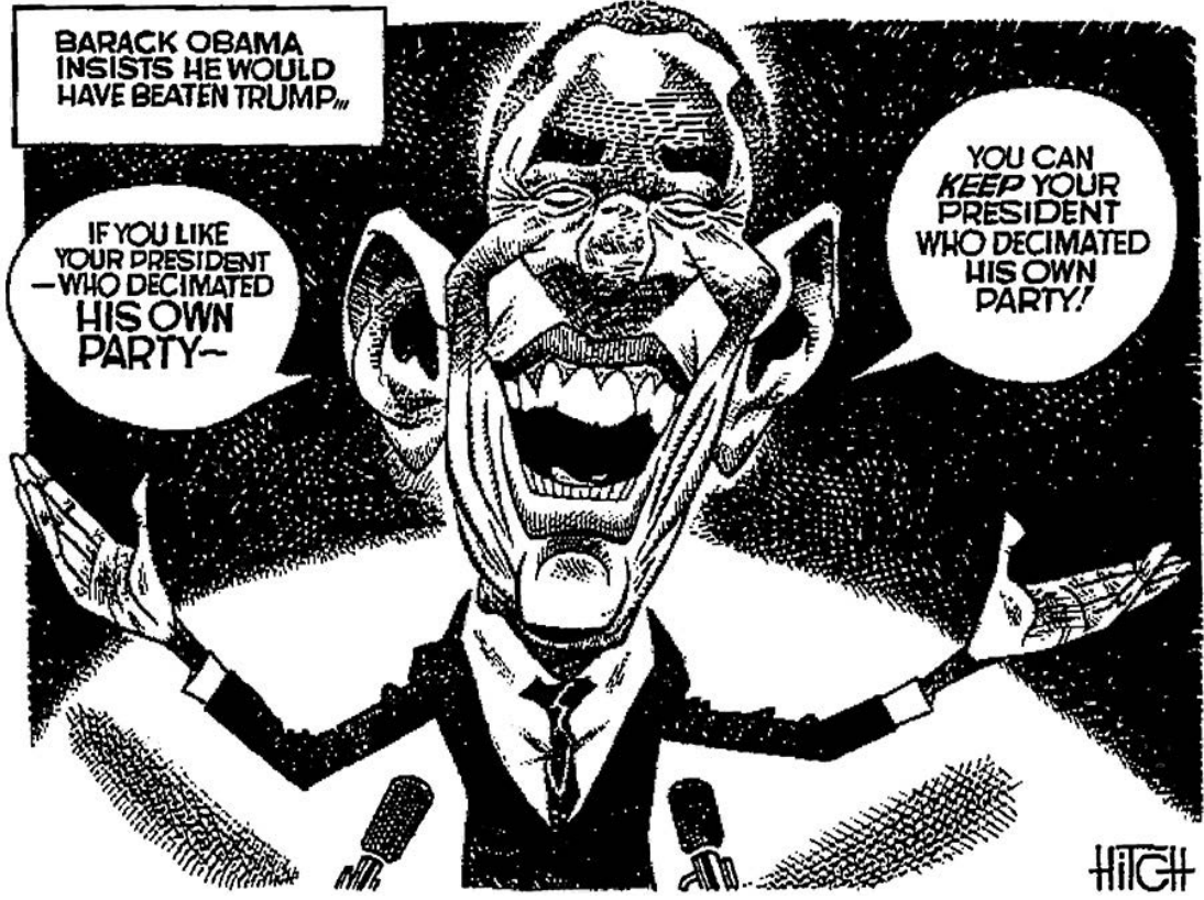
THE ANDERSON COUNTY REVIEW'S

Pouting, indeed, is all they have left. Frankly my dears, Trump doesn't give a damn.