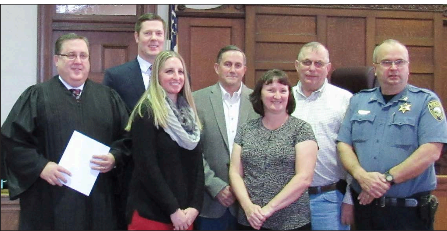
THE ANDERSON COUNTY REVIEW 1-17-2017