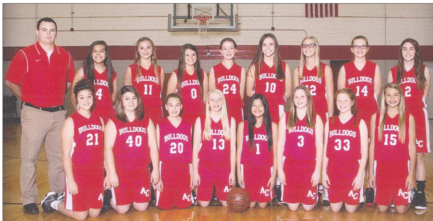
THE ANDERSON COUNTY REVIEW 1-10-2017