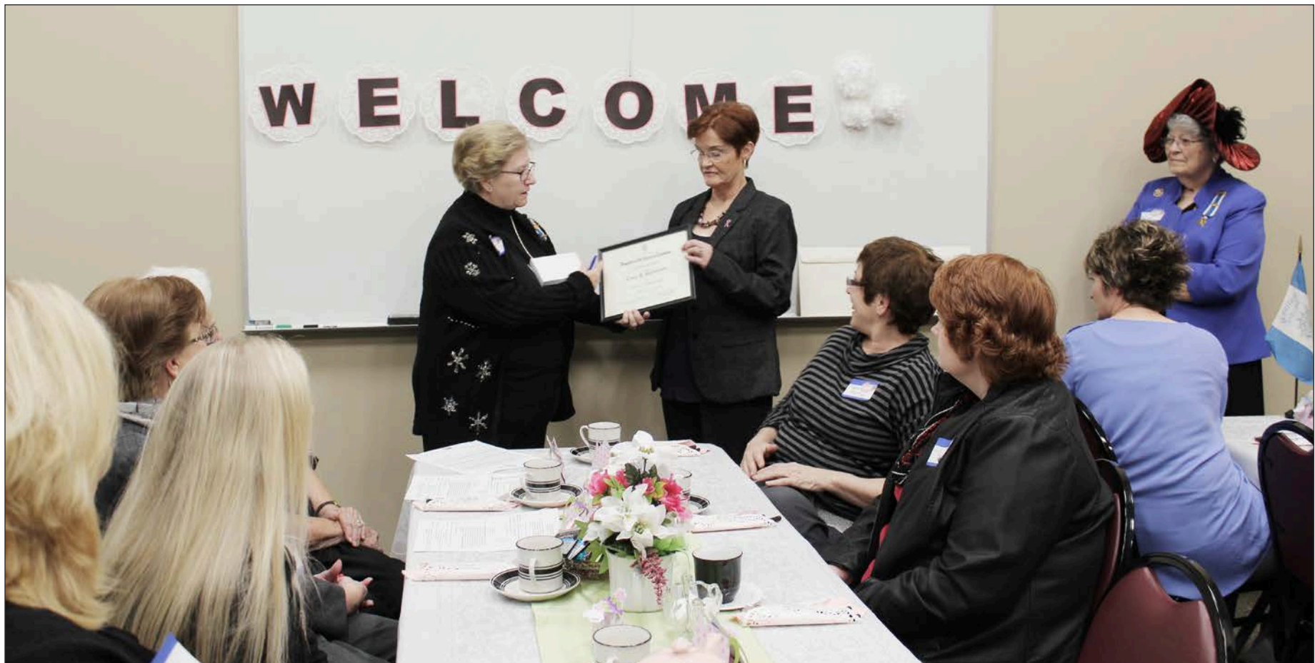
THE ANDERSON COUNTY REVIEW 1-17-2016