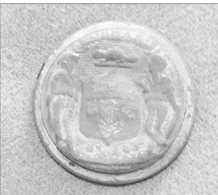
THE ANDERSON COUNTY REVIEW 1-10-2017

The cost to attend is $5. Performances will take place at 7 p.m. on Saturday, January 14, at the Anderson County High School Auditorium. Come out and support the ACHS Theatre Program!