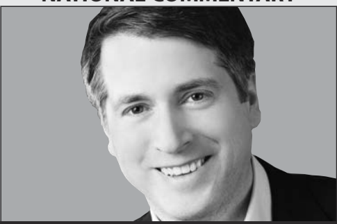
RICH LOWRY, King Features Syndicate

interests and values weren't going to act as a band of righteous international enforcers. In fact, as demonstrated in Rwanda and the Balkans, when confronted by hideously predatory forces bent on mayhem and murder, U.N. peacekeepers would simply stand aside.