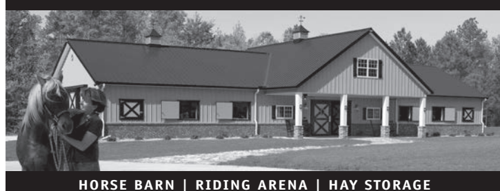
HORSE BARN | RIDING ARENA | HAY STORAGE

A Commitment to Quality Morton Buildings understands that safety & quality are the most important factors when constructing a horse facility. That's why we manufacture many of our own components, including stalls.