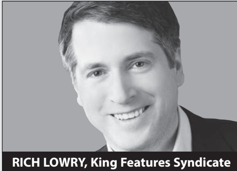
RICH LOWRY, King Features Syndicate