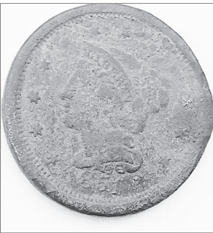
THE ANDERSON COUNTY REVIEW 12-6-2016

This Large Cent was found during an excavation of the old hotel/boarding house for railroad workers this summer.