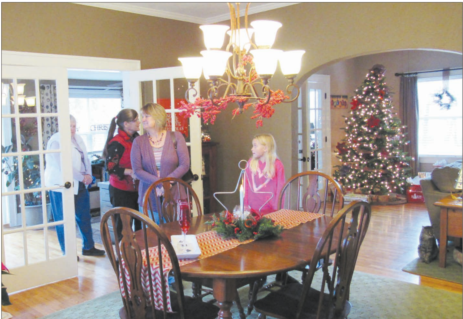
THE ANDERSON COUNTY REVIEW 12-6-2016

Tuesday, December 13 • 9 a.m. - TOPS at Garnett Methodist Church basement, 2nd & Oak