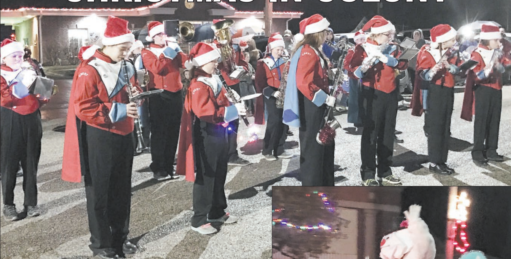
THE ANDERSON COUNTY REVIEW 12-6-2016

The Colony community had its annual Christmas parade Saturday, Dec. 3. Pictured above is the Crest Junior-Senior High Band. At right is the Frosty The Snowman float by the Colony City Library. Below is Rudolph and the Misfit Toys, a float submitted by the Schmidt Family.