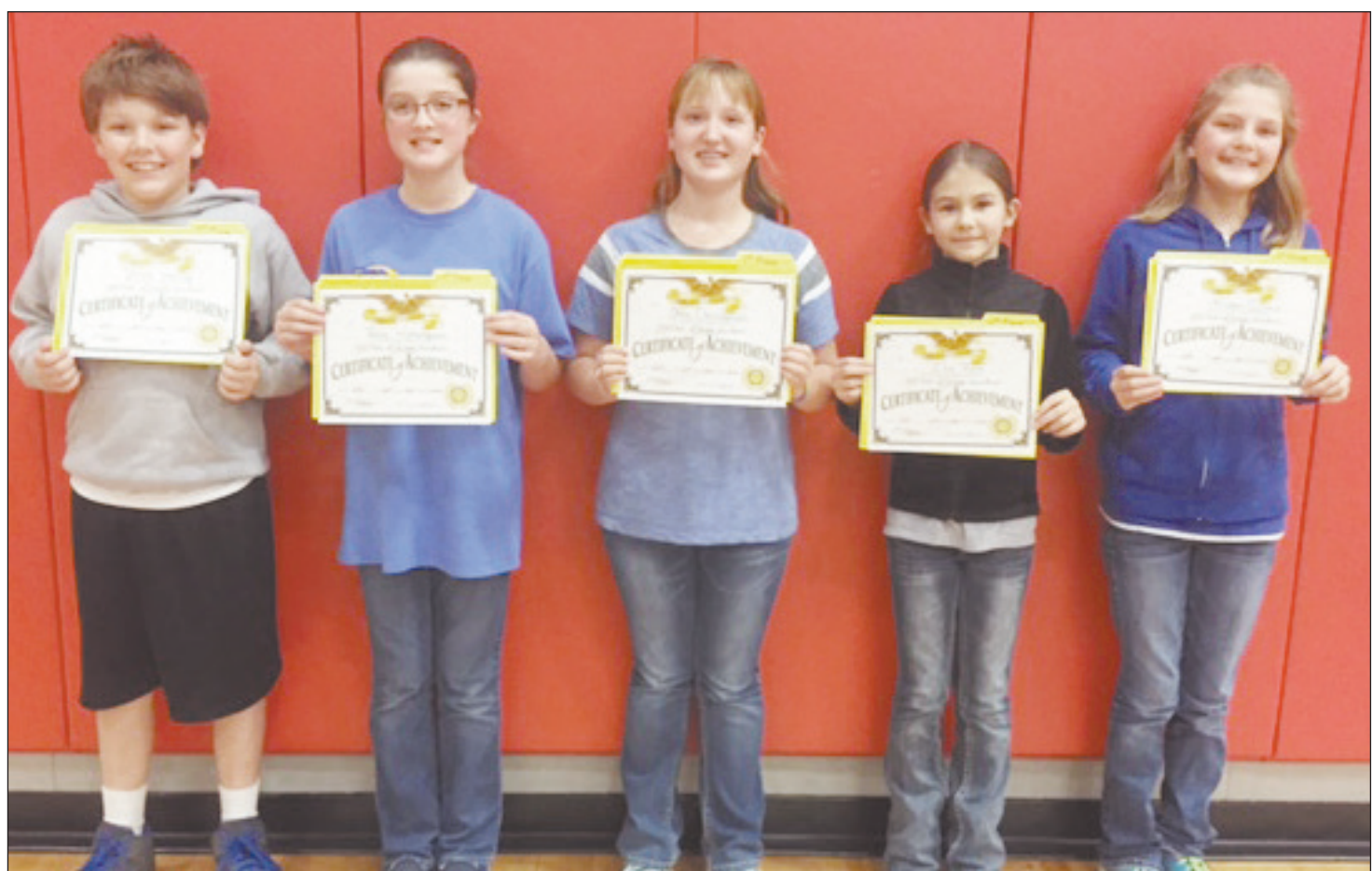
THE ANDERSON COUNTY REVIEW 12-6-2016

The Garnett Duplicate Bridge Club welcomes all bridge players Wednesdays at 1:00 at the Garnett Inn.