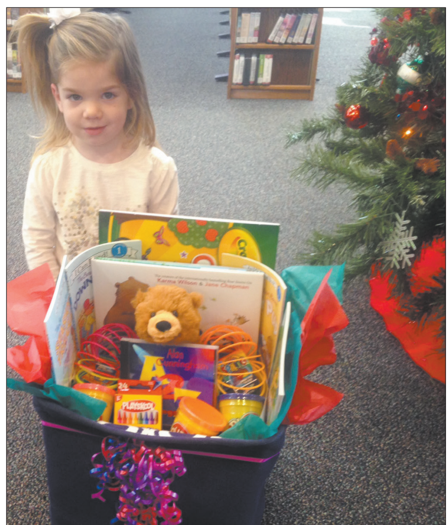
THE ANDERSON COUNTY REVIEW 11-27-2016

Sponsors this year's project were: BPW, Chapter Y P.E.O., D.A.R.- Four Winds Chapter, Friends of the Library, Garnett Lions Club, The Optimist Club of Garnett, Rockers Insurance Agency, and Garnett Rotary Club. Thank you for helping us reach new heights during this year's Kansas Reads to Preschoolers project.