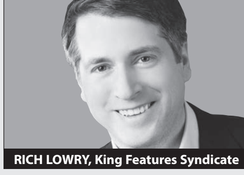
RICH LOWRY, King Features Syndicate

This is a far cry from Franklin D. Roosevelt's notorious Executive Order 9066 setting in motion the Japanese internment of World War II.