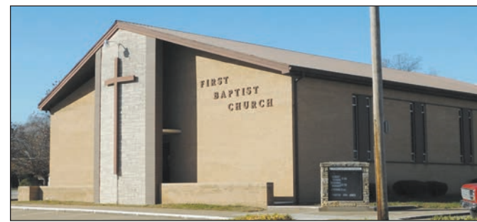
First Baptist Church, 417 S. Walnut

Custom printed napkins for your party, anniversary, shower or special event - Call the Review today (785) 448-3121