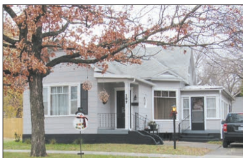
Ian Rocker, 107 W. 2nd