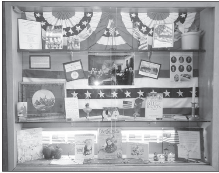
This display about the U.S. Constitution can be viewed at the Garnett Public Library during the month of September.

"Constitution Week is the perfect opportunity to read and study this great document which is the safeguard of America!"