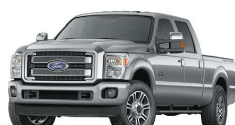
2016 Ford Superduty