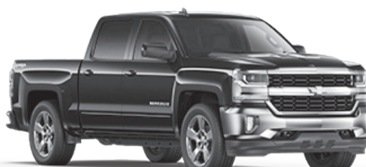
2016 Chevy Silverado

Now featuring 2016 Buicks, Chevys and Fords!