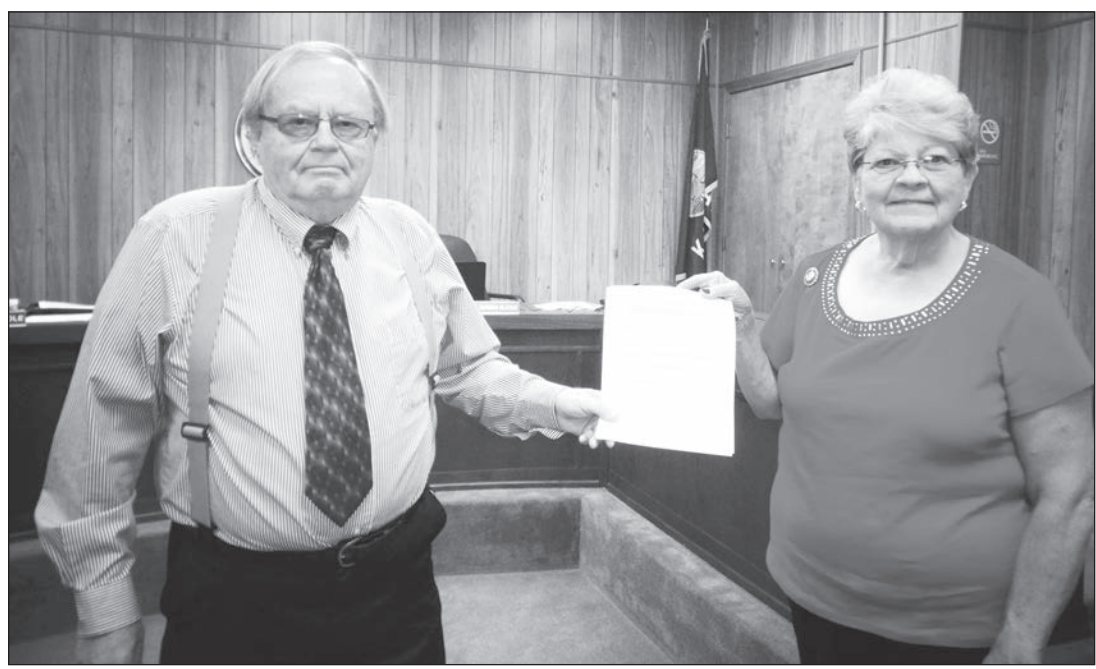
THE ANDERSON COUNTY REVIEW 9-20-2016