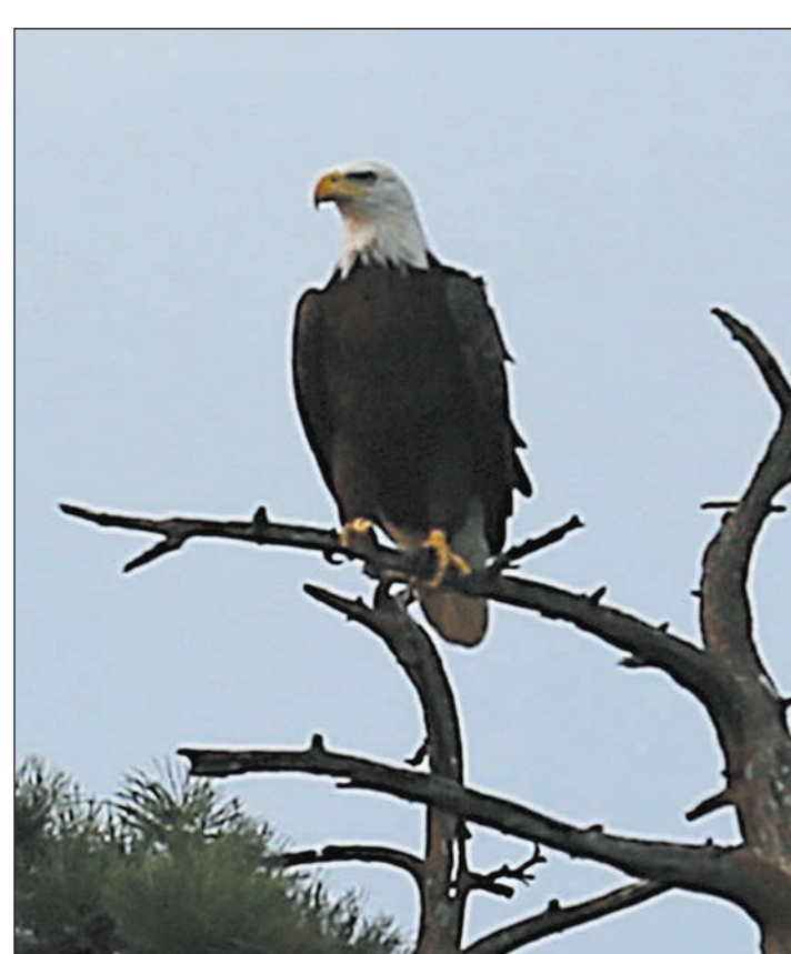
THE ANDERSON COUNTY REVIEW 9-20-2016