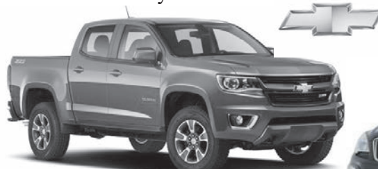
2016 Chevy Colorado