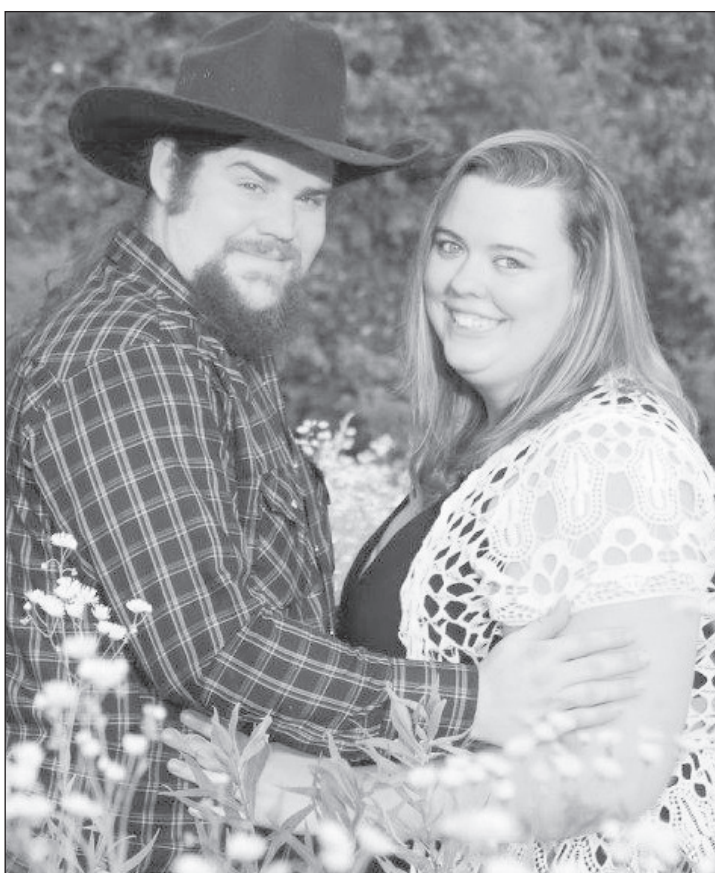
THE ANDERSON COUNTY REVIEW 9-20-2016