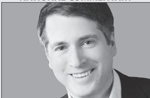
RICH LOWRY, King Features Syndicate