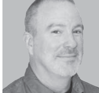
By: DANE HICKS