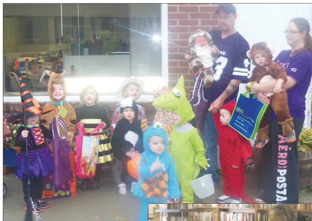
THE ANDERSON COUNTY REVIEW 08-29-2010

Above, Richmond Library staff took the Story Time kids trick-or-treating at businesses on Central Street. The kids go to the Richmond Community Building where they have the Meals on Wheels program and hand out pumpkins to the seniors too. At right, the adults made mason jar ring pumpkins for a Halloween craft.