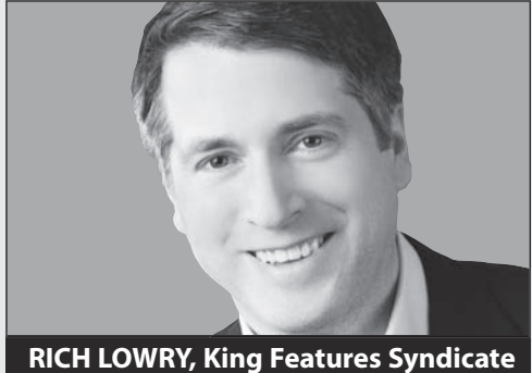
RICH LOWRY, King Features Syndicate

D prescription-drug plan had a rocky start. This is absurd. The Part D website experienced what could be accurately described as "glitches," rather than the meltdown of HealthCare.gov. And Democrats supported the basic idea of the prescription-drug benefit.