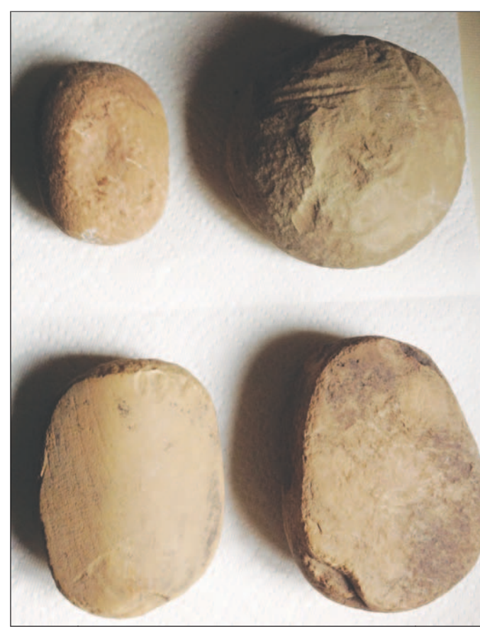
THE ANDERSON COUNTY REVIEW 11-12-2013