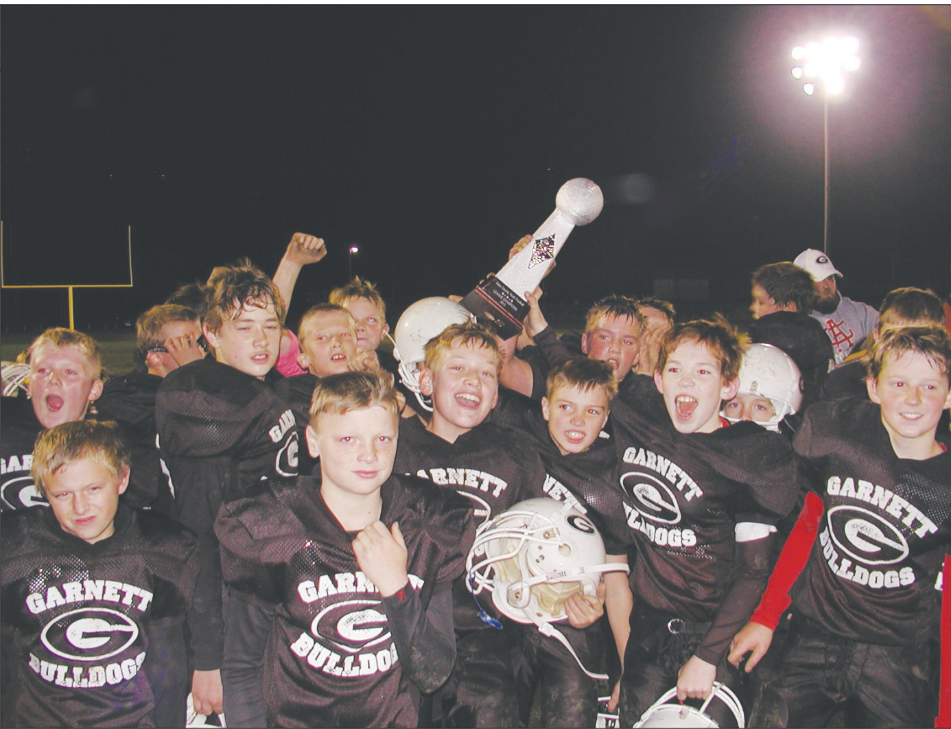
THE ANDERSON COUNTY REVIEW 11-12-2013