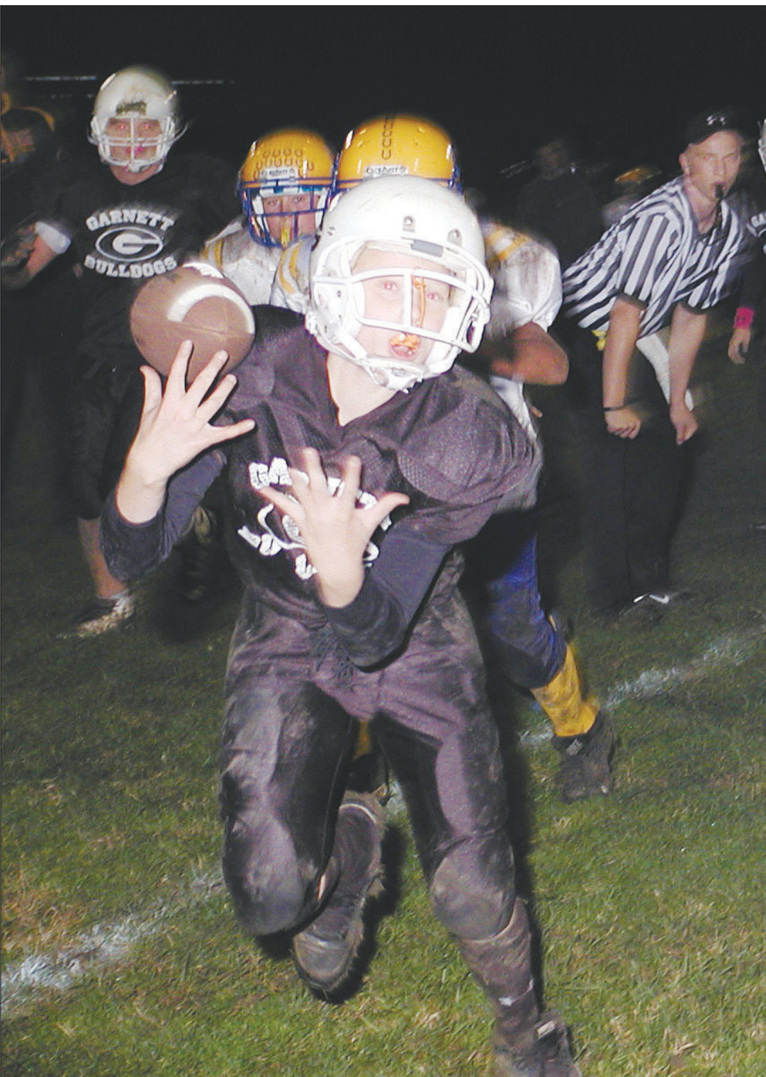
THE ANDERSON COUNTY REVIEW 06-29-2010