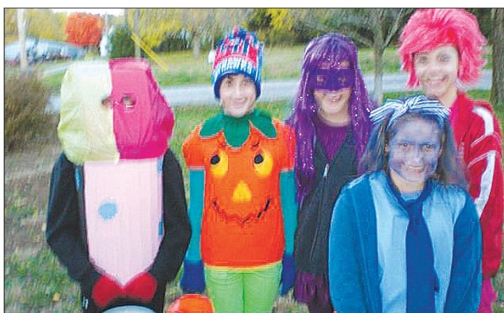
THE ANDERSON COUNTY REVIEW 11-12-2013

Poinsettias are needed for decorating at the Christmas program. Can anyone help by loaning theirs for this occasion? It would be much appreciated. Christmas Store will be held Dec. 16, 17 and 18. Members will contact different places for big prize items for the school