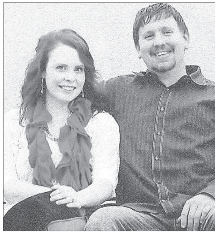
THE ANDERSON COUNTY REVIEW 05-28-2013