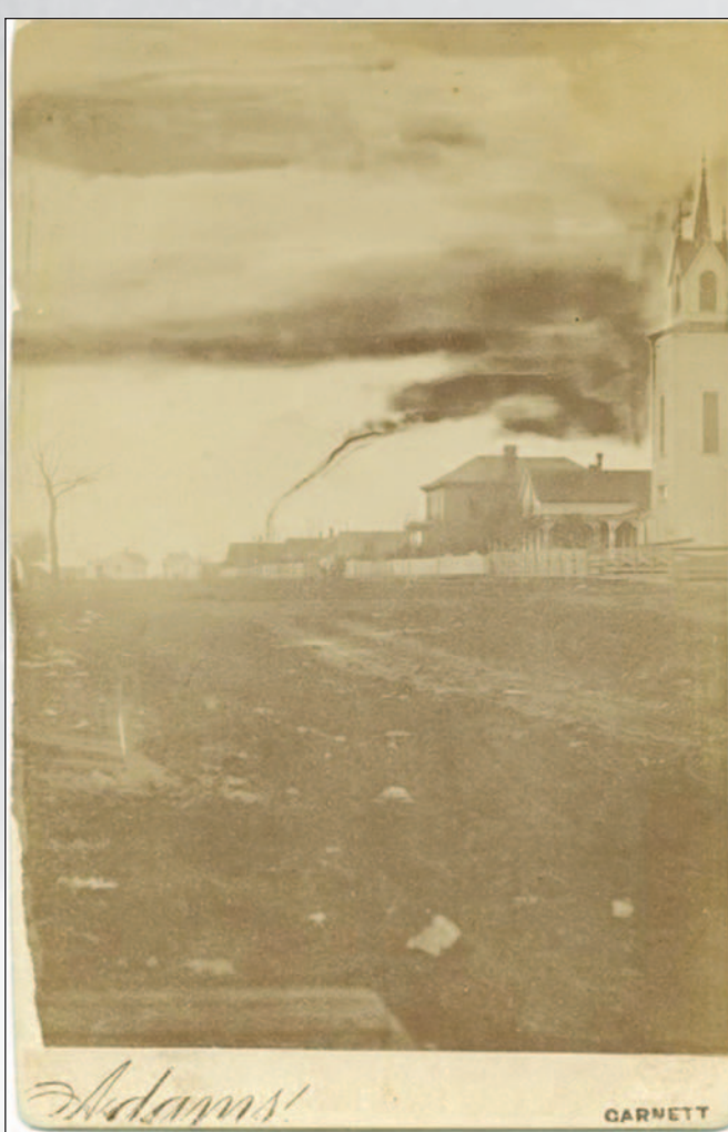
THE ANDERSON COUNTY REVIEW 05-28-2013