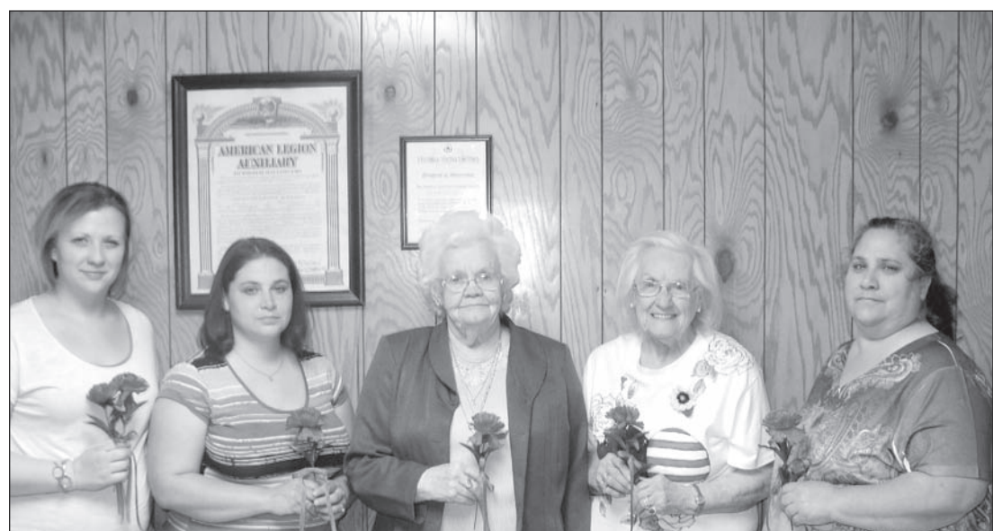
THE ANDERSON COUNTY REVIEW 05-21-2013