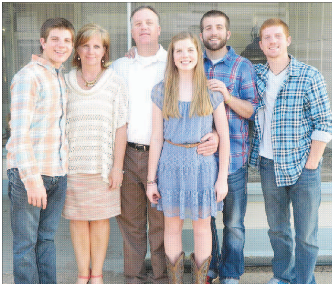
THE ANDERSON COUNTY REVIEW 06-29-2010