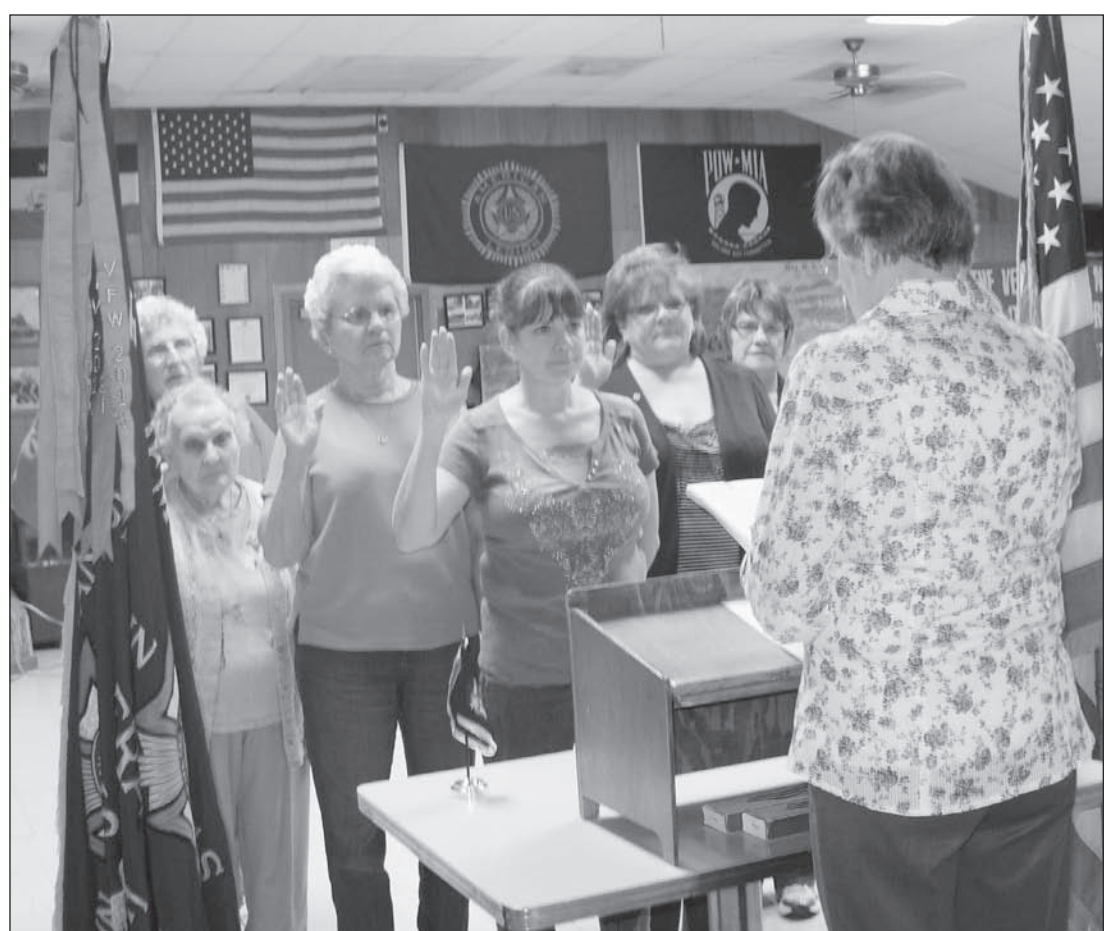
THE ANDERSON COUNTY REVIEW 05-21-2013