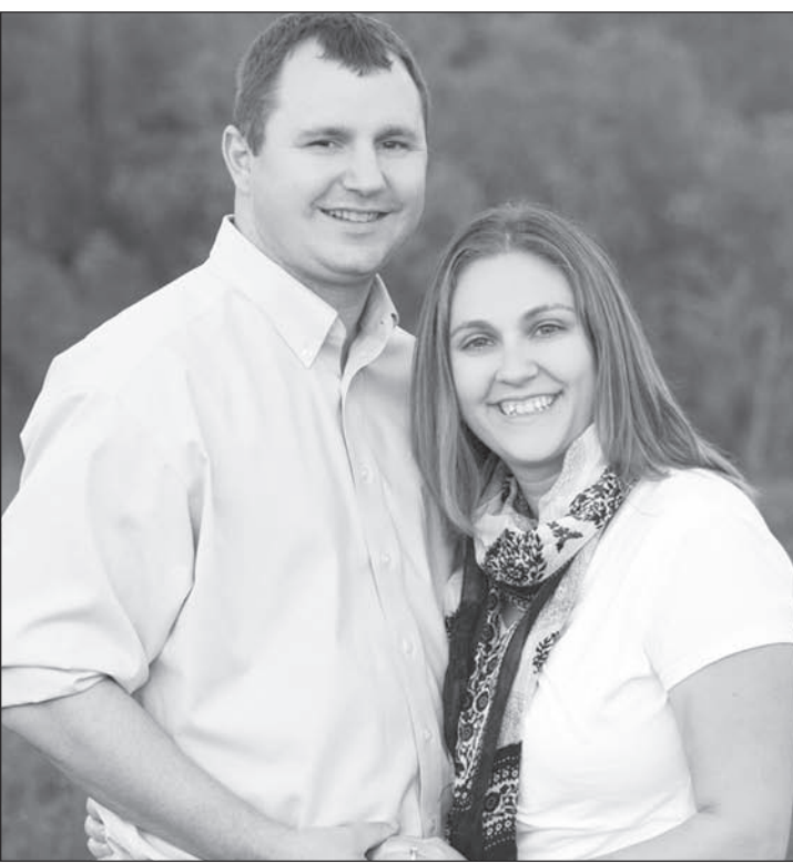
THE ANDERSON COUNTY REVIEW 05-28-2013