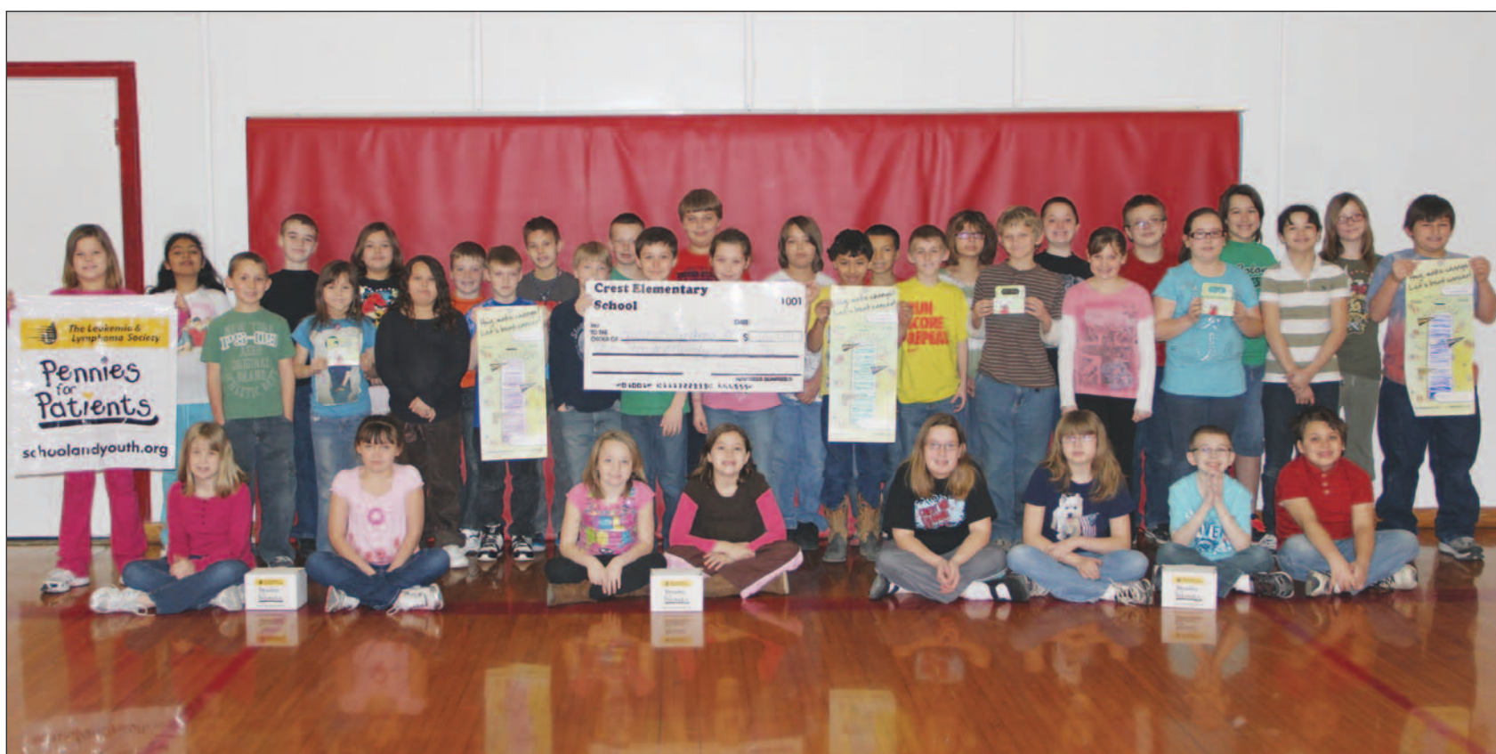
THE ANDERSON COUNTY REVIEW 02-26-2013

Crest Elementary grades 3, 4 and 5 gathered $1,029.04 for Pennies for Patients, a program to raise money to help the Leukemia and Lymphoma Society.