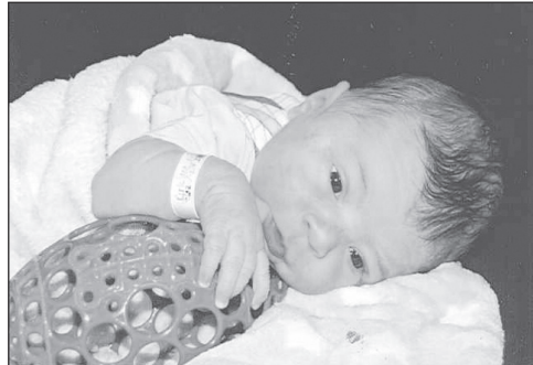
THE ANDERSON COUNTY REVIEW 08-07-2012