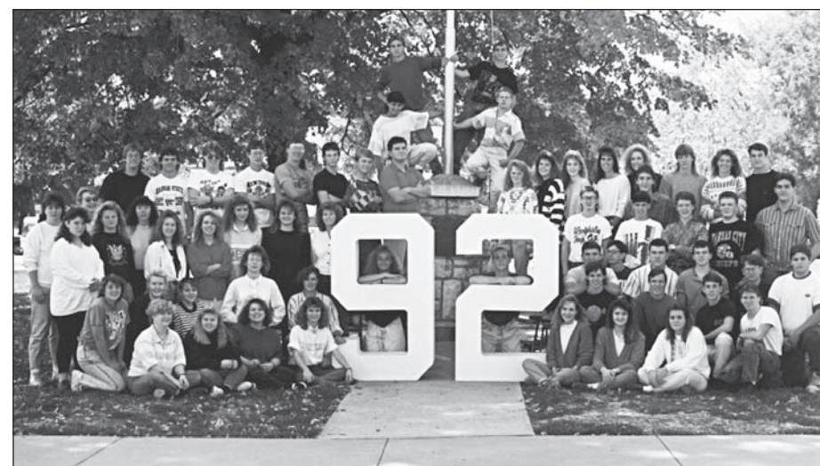
The Class of 1992 was the final high school graduating class at Garnett. After that, high school was moved to Anderson County High School. Elementary grades 2-6 were moved to the former high school building, which was renamed Garnett Elementary Center (GEC).