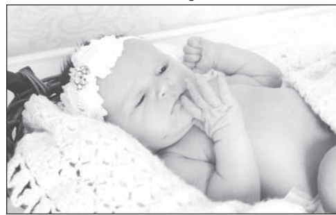
THE ANDERSON COUNTY REVIEW 08-07-2012