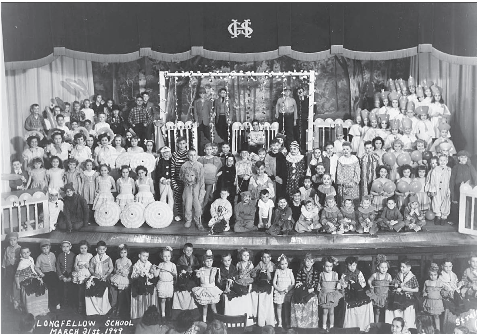
Longfellow Elementary School presented its spring program in the Garnett High School auditorium in 1948.