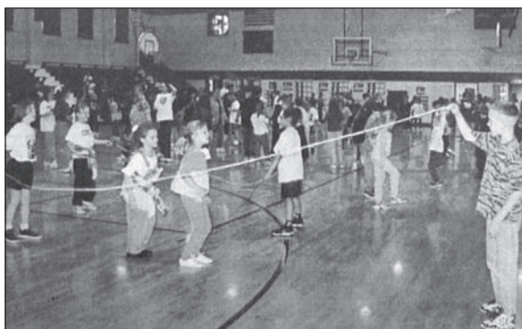
As an elementary school in 1993, students participated in Jump Rope for Heart in what is now the Ray Meyer Gym.