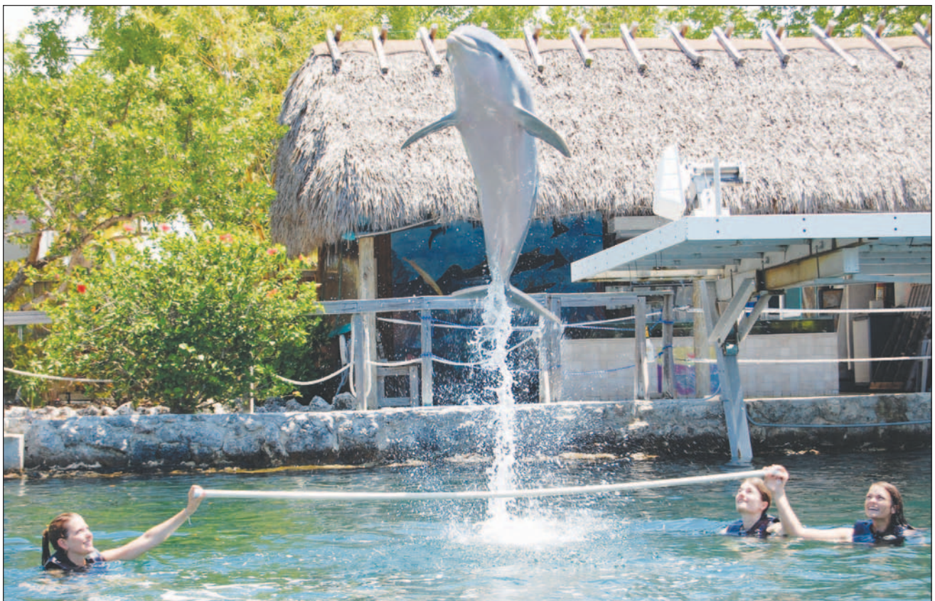
THE ANDERSON COUNTY REVIEW 08-07-2012

I witnessed first hand the extraordinary atmosphere IDC provides for the families and their child/children with disabilities. I was able to learn about multiple disabilities such as autism, heart disorders, cerebral palsy, down