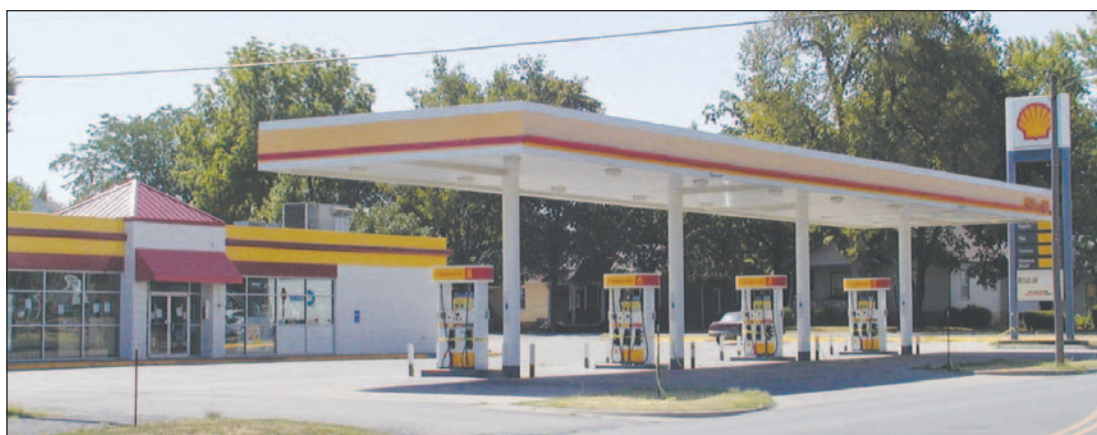
THE ANDERSON COUNTY REVIEW 08-07-2012

The former Shell station, 59 Express, will become the home of Short Stop after a remodel. The current Short Stop location will be closed and offered for sale.