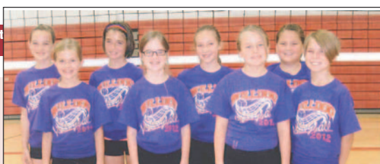
ACHS volleyball camps. See Page 5A