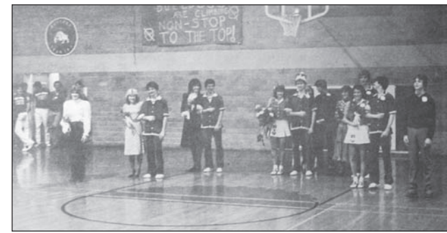
Homecoming, 1983, in what is now the Ray Meyer Gym.