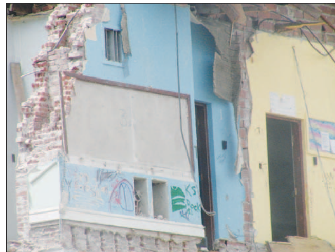
During demolition Aug. 2, former classrooms were visible as parts of the building came crumbling down.