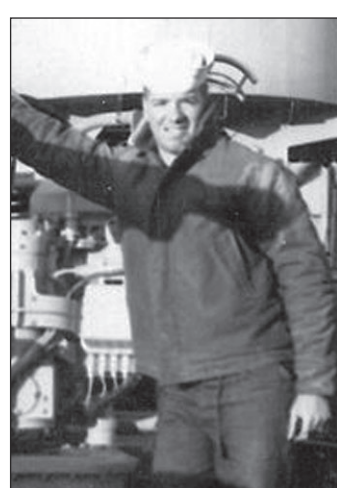
THE ANDERSON COUNTY REVIEW 08-07-2012

Cake and coffee will be served at the Coffee Loft in Garnett, Saturday, August 11, from 2 - 4pm.