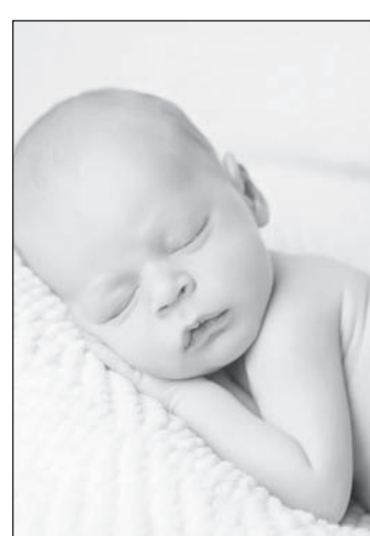
THE ANDERSON COUNTY REVIEW 08-07-2012